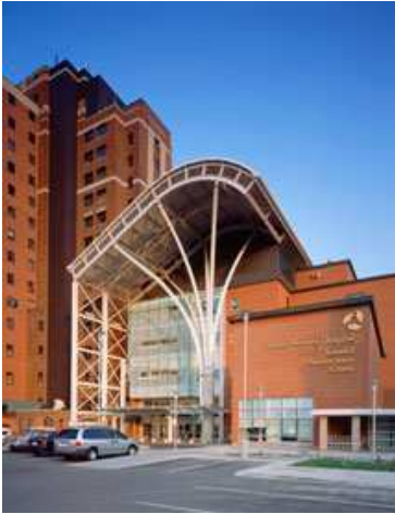
Toronto Western Hospital

In the spring of 2014, the Leadership and Mentoring Committee of the Psychologists in Hospitals Section of CPA conducted a survey to gather information about the role of Professional Practice Leaders/ Chiefs across Canada. Our goal was to glean a better understanding of how PPLs function in hospitals, provide the bases for forming benchmarks for PPL responsibilities, and identify areas where our profession may need to advocate for improvements. In total, we had 22 responses from PPLs across Canada: Alberta (2), Manitoba (1), New Brunswick (2), Nova Scotia (1), Quebec (5), and Ontario (10). About half of the respondents were from university affiliated teaching hospitals and 69% had CPA-accredited predoctoral internship/ residency programs. Respondents represented a broad spectrum of services for children and adults, health and mental health, tertiary care, and military. Most respondents were well seasoned in their positions, averaging 5 years (range < 1 year to 11 years). In total, respondents represented 348 doctoral (range 0 – 125; = 17) and 253 masters (range 0 – 150; = 12) prepared psychologists. On average, .5 FTE was allocated for PPC/PPL responsibilities, ranging from no specifically allocated time to full time. Most health centres had program or matrix types of