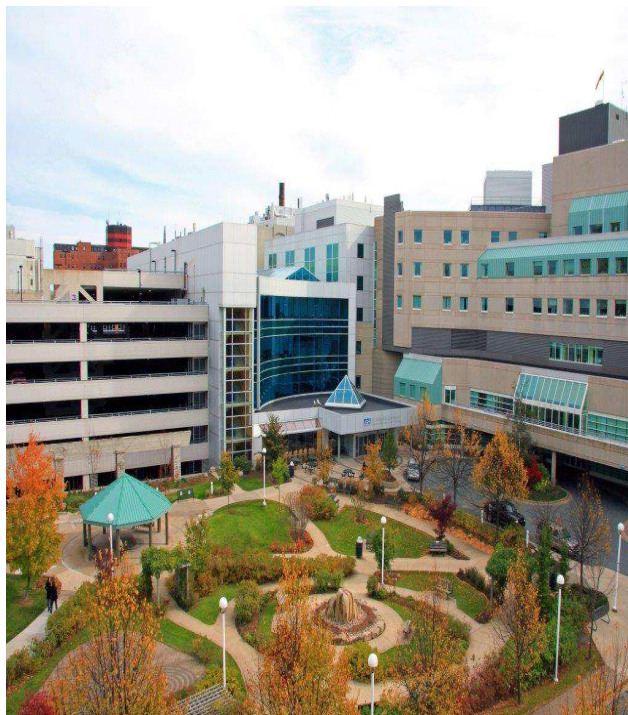
IWK Health Centre in Halifax, Nova Scotia